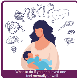
What to do if you or a loved one feel mentally unwell