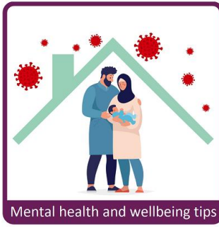
Mental health and wellbeing tips